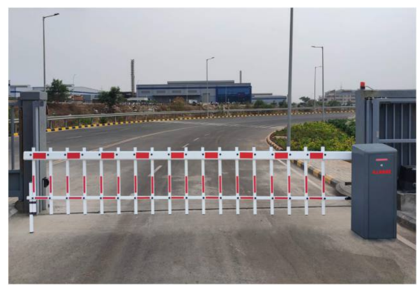
Note: Boom skirting can be provided upto 4.5 meters